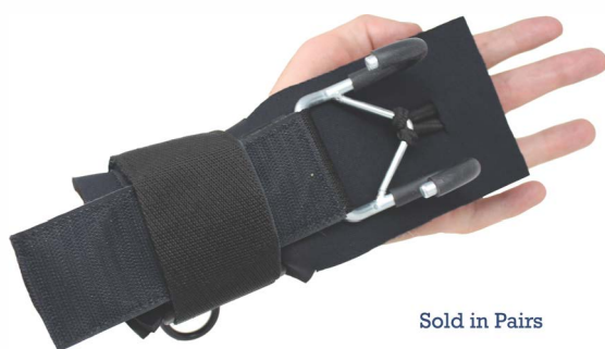
Sold in Pairs