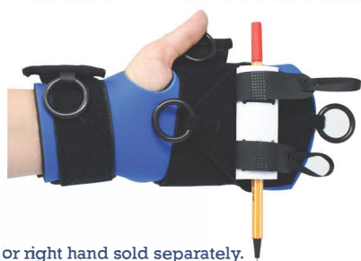
Left or right hand sold separately.